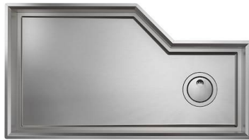
Sink Diade 3028 000